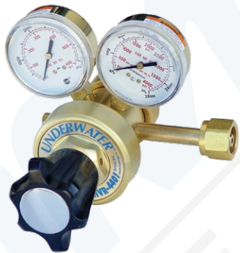
High Volume Oxygen Regulator

The BR-22 can also be used as a welding electrode holder. The BR-22 Cutting Torch is built to deliver years of trouble-free performance at minimum cost.