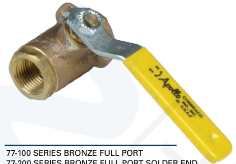
77-100 SERIES BRONZE FULL PORT 77-200 SERIES BRONZE FULL PORT SOLDER END