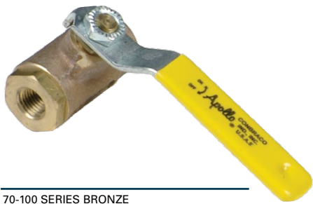
70-100 SERIES BRONZE 70-200 SERIES BRONZE SOLDER END

Apollo ball valves revolutionize the way water and air are handled in commercial, industrial, and residential applications. Today, Apollo has manufactured more types of bronze and steel ball valves than any other US company. More than 6 million Apollo bronze ball valves are put into service every year, making it America's most trusted ball valve brand.