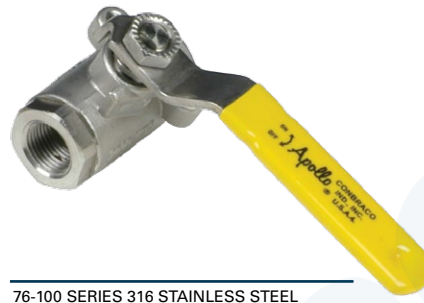
76-100 SERIES 316 STAINLESS STEEL 76-500 316 SS W/ SPRING RETURN HANDLE