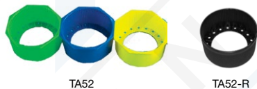
Tank Boots TA52

Available Colors: Black, Clear, Pink, Royal Blue, Red, Yellow