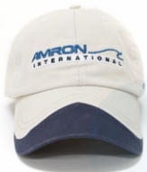
Amron Cap AMR-CH10

Industry Standard Tank Inspection Sticker. 3.5 inch by 3.33 inch.