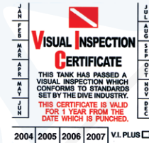
Visual Tank Inspection Stickers DS05

Industry Standard Tank Inspection Sticker. 3.5 inch by 3.33 inch.