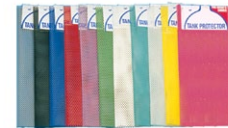
Tank Protector Mesh TA60

• Black • Short Sleeve • 100% Preshrunk Cotton Available Sizes: L-3XL