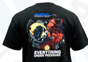
Amron Dive T-Shirt AMR-CT10

Classic Amron International Two Tone Bill Baseball Cap. Perfect for keeping your eyes and face shielded from the harmful UV Rays.