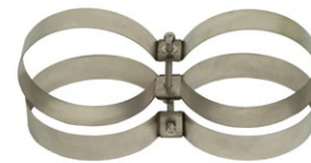
Dual Cylinder Bands SB725

Available Colors: Black, Blue, Pink, Green, Red, Yellow