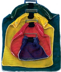
Goody Bags SEE BELOW