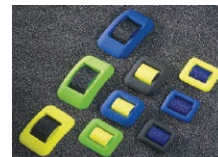
Coated Solid Diving Weights SEE BELOW