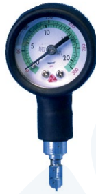
Plug-In Type Checker SA09

Plug in type intermediate pressure checker with air line bleeder valve fits standard BC hose.