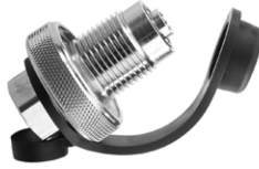
Din Adapter 300 Bar SAA5300

Scott Fill Adapter Type A for filling of SCBA bottle.