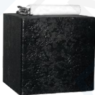
Odom Weight SEE BELOW