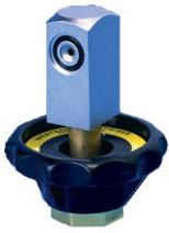
Scott Fill Adapter Type A AA97

Scott Fill Adapter Type A for filling of SCBA bottle.