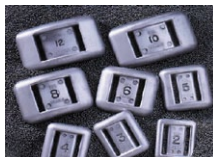
Uncoated Solid Diving Weights SEE BELOW