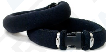
Ankle Weights WB95

3.5 lbs per pair with quick release clip.