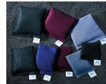
Soft Diving Weights SEP-M(WEIGHT)

3.5 lbs per pair with quick release clip.