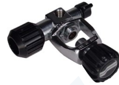
Yoke with On/Off Valve SVA3010

Converts standard yoke connection to a 300 bar DIN connection