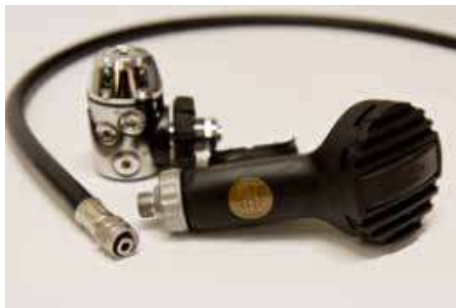
Jetstream Mk3, art. nr 0100-005