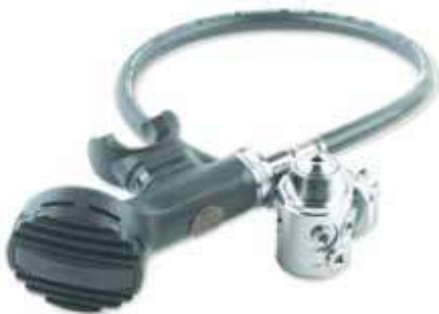
Jetstream Classic, art. nr 3960