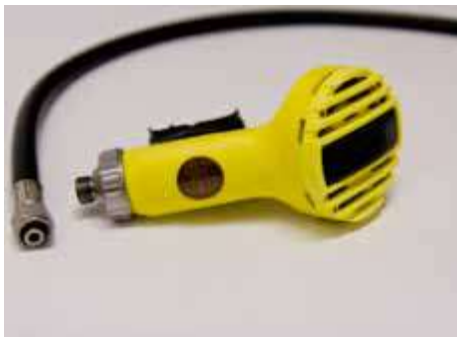
Jetstream Mk3 & Classic Octopus, art. nr 0100-006