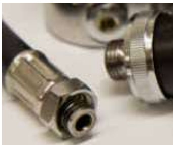
Hose connection, Jetstream Mk3