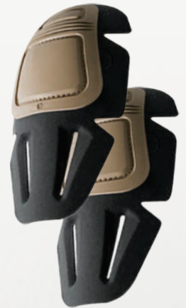
Includes Crye Airflex™ Knee Pads