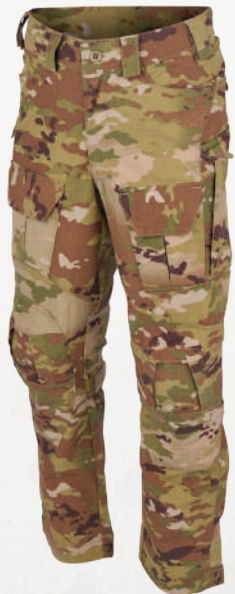
Worn Without Crye Airflex™ Knee Pads