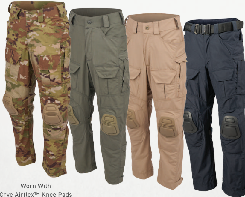
Worn With Crye Airflex™ Knee Pads