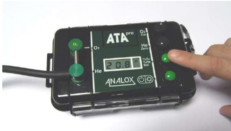
Analysing your mix