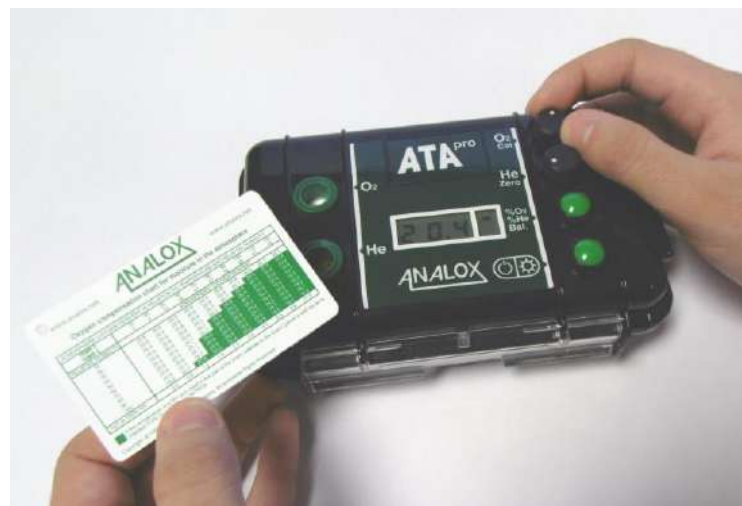
O 2 calibration in clean air