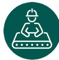
Manufacturing, Welding & Metal Fabrication