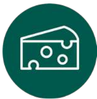
Food Manufacturing & Packaging