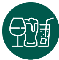
Breweries & Wineries