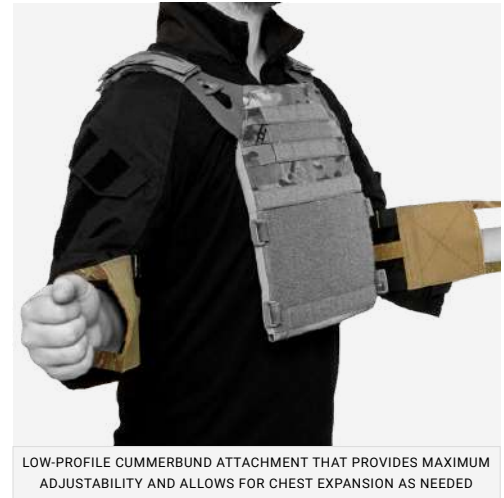
LOW-PROFILE CUMMERBUND ATTACHMENT THAT PROVIDES MAXIMUM ADJUSTABILITY AND ALLOWS FOR CHEST EXPANSION AS NEEDED