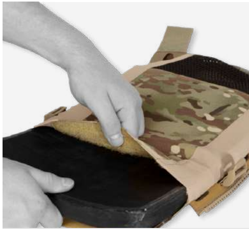
HIGH PERFORMANCE STRETCH MATERIAL THAT ALLOWS FOR PLATES OF VARYING THICKNESS