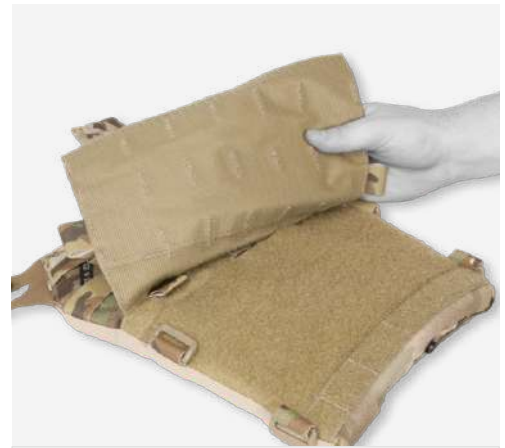
VELCRO® BRAND PANEL ON THE FRONT OF THE CARRIER ALLOWS DETACHABLE MOLLE OR MAG POUCH FRONT FLAP