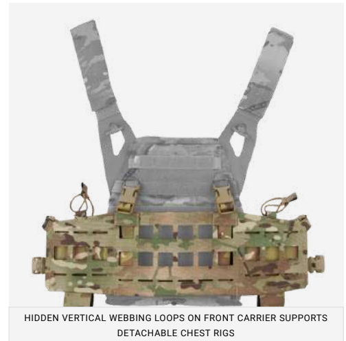
HIDDEN VERTICAL WEBBING LOOPS ON FRONT CARRIER SUPPORTS DETACHABLE CHEST RIGS