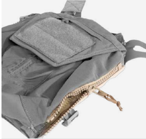
ZIPPERS ALONG THE SIDES OF THE BACK CARRIER FOR ZIP-ON PANELS