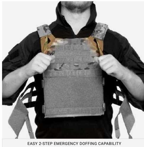
EASY 2-STEP EMERGENCY DOFFING CAPABILITY