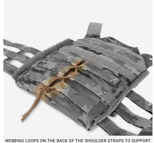
WEBBING LOOPS ON THE BACK OF THE SHOULDER STRAPS TO SUPPORT BACK PANELS