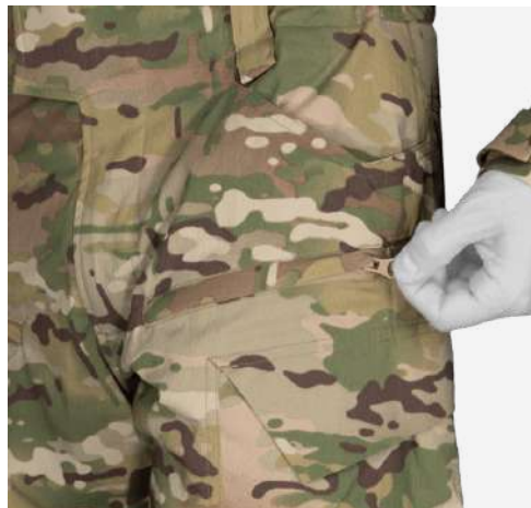
ZIPPERED THIGH POCKET