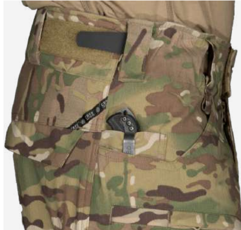
DEDICATED KNIFE POCKET