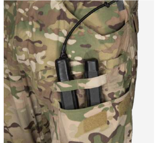
CARGO POCKET PASS-THROUGHS FOR DOOR CHARGES