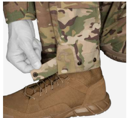
ADJUSTABLE SNAP HEM