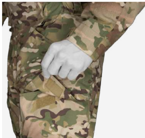
LOW PROFILE CARGO POCKET