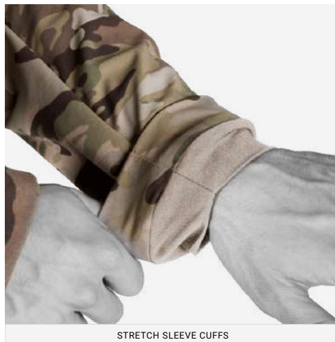
STRETCH SLEEVE CUFFS