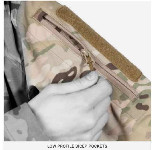
LOW PROFILE BICEP POCKETS