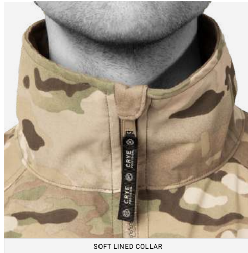
SOFT LINED COLLAR