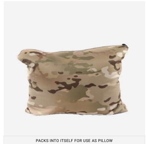
PACKS INTO ITSELF FOR USE AS PILLOW