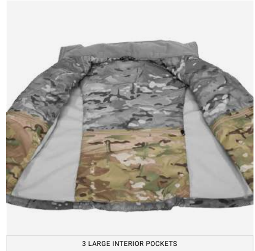
3 LARGE INTERIOR POCKETS