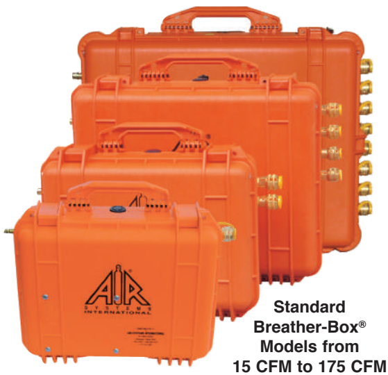
Standard Breather-Box® Models from 15 CFM to 175 CFM