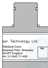
ANALOX 9212 OXYGEN SENSOR

WARNING If after handling the sensor your fingers or other part of your body feels slippery or stings wash with a lot of water.