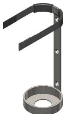
Figure 3 3.0 Litre Mount SE488010