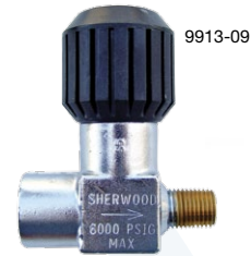
Line Valve SEE BELOW