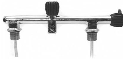
Twin Manifold with J Valve 2800-00