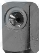
SCUBA Block Adapter 9-3030-1

This heavy duty SCUBA to DIN Fill Adapter from Sherwood SCUBA is made to last. Adapts a yoke to DIN. For filling purposes only to 3000 psi.