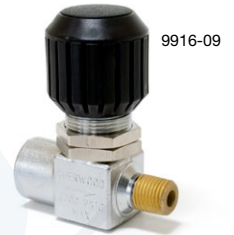
9916-09 Line Valve with Locking Nuts