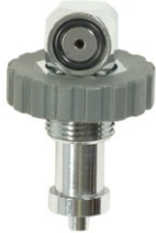
DIN Filler Adapter AC375