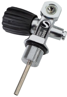
Sherwood SVA5000 Valve SVA5000-48

The critical link between your regulator and tank, the patented Sherwood valve was designed specifically to handle today's high performance regulators.