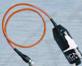
Mini ROV Mountable