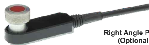
Right Angle Probe (Optional)

With multiple echo, readings are taken by measuring the time delay between any three consecutive backwall echos. The time of T1 (coating thickness) is ignored. The times of T2 and T3 are equal to the time that it takes to travel through the metal. Only by looking at three echos can the measurements be automatically verified (where T2 = T3).