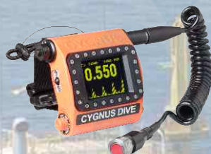
DIVE (Underwater A-Scan)