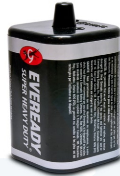
Non-Rechargeable Battery Amcom II 2890-03

Non-Rechargeable 6 VDC Screw-Top Dry Cell Lantern Batteries