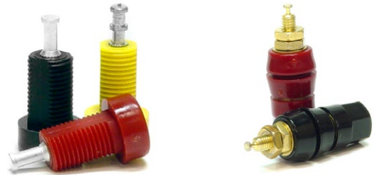
Banana Jack and 5-Way Binding Post SEE BELOW