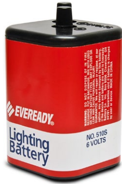
Non-Rechargeable Battery Amcom I 2890-01

Non-Rechargeable 6 VDC Screw-Top Dry Cell Lantern Batteries