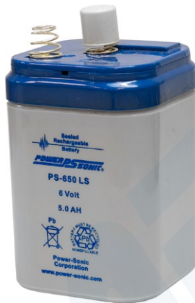
Rechargeable Battery Amcom 2890-04

Non-Rechargeable 6 VDC Spring-Top Dry Cell Lantern Batteries for Amcom™ communicators and other applications.