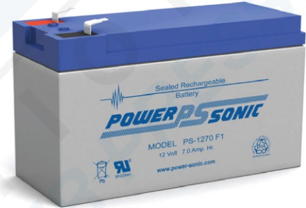
Replacement External Battery Amcom 2890-05

Rechargeable 6 VDC Spring Top Gell-Cell Battery.