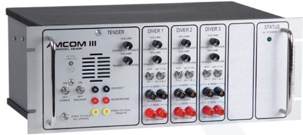
2830R/24 3-DIVER RACK MOUNT COMMUNICATOR