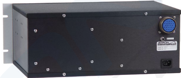
RACK MOUNT COMMUNICATOR REAR VIEW