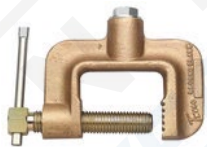
Brass "C" Ground Clamp