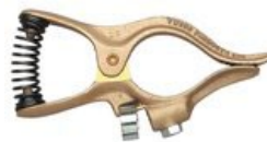
Copper Push-On Ground Clamp