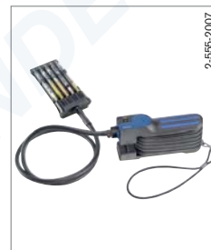
Simultaneous Test Set