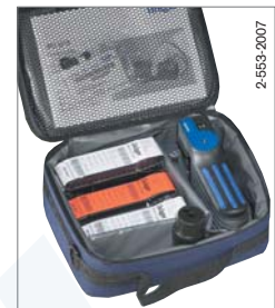
accuro® Soft Side Kit