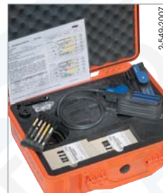
Civil Defense Simultest (CDS) Kit