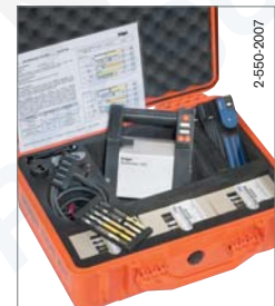
CDS/HazMat Kit with Quantimeter